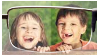
Regular Lens KODAK Anti-Reflective Lens

KODAK Total Blue™ Lenses provide all the benefits of anti-reflection plus filtration of harmful High Energy Visible (HEV) blue light. Silk is included.